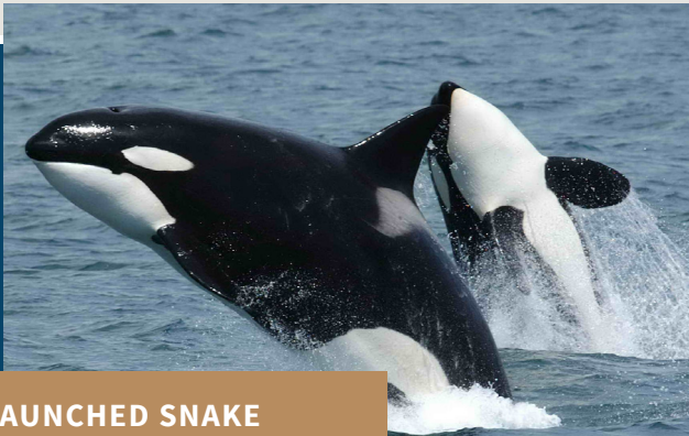
LAUNCHED SNAKE RIVER SAVERS FOR ORCA