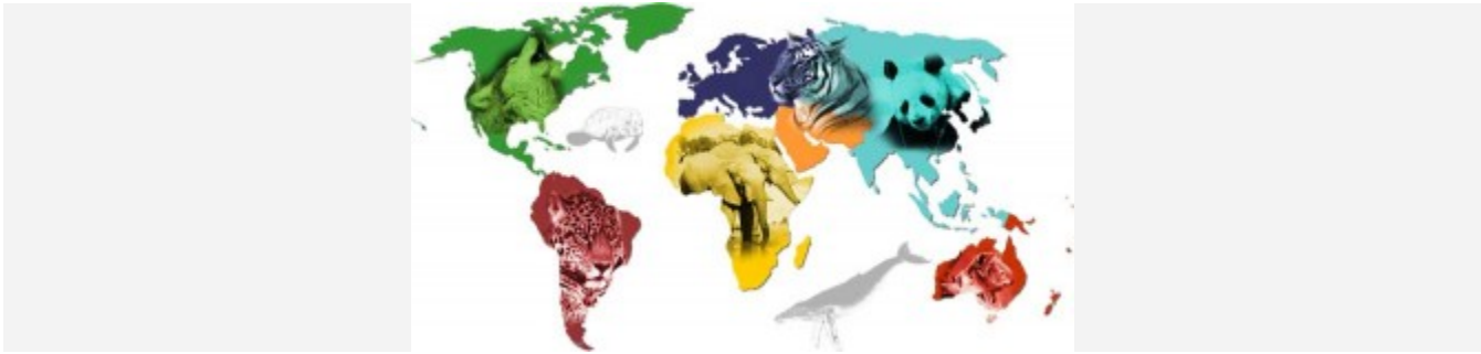
Endangered species across the world.

There have been five mass extinctions – times when the Earth has lost more than three-quarters of its species in a relatively short timeframe – during the past 540 million years.