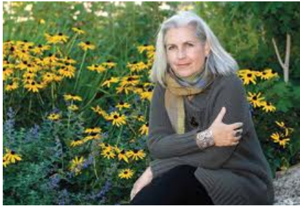
(Terry Tempest Williams will present her recent book "When Women Were Birds" Nov. 3 at the Sundance Author Series.)