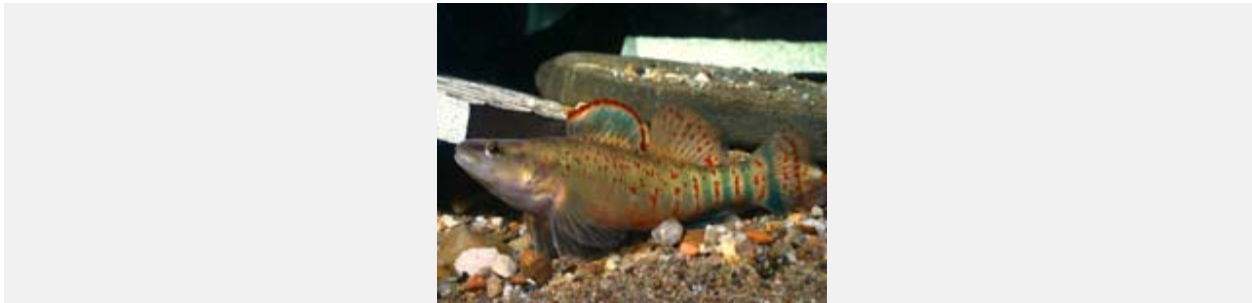
Kentucky arrow darter is a candidate for listing under the ESA.

protections in 1975 after they had been wiped out across much of their historical range. They have since made a slow comeback, prompting the U.S. Fish and Wildlife Service to advance plans on whether to take more than 700 bears across the Yellowstone region of Montana, Idaho and Wyoming off the threatened-species list. A decision is expected in January. It would open the door for limited sport hunting of the bears in the area, though protections for their habitat would remain in place. Fights like these are to be expected, given that people and nature are competing directly for space and resources with wildlife, and that we live in a democracy. And like all laws, after four decades just about all sides say the EPA could stand some updating and improvement.