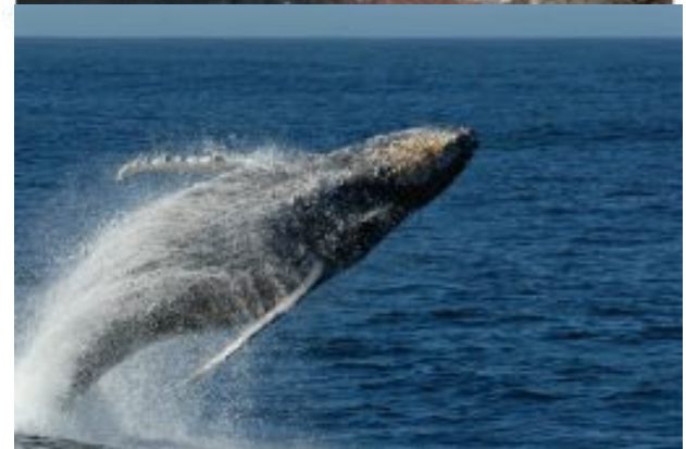
Photos top to bottom: Driftnet illustration, rare megamouth shark in CA driftnet, humpback whales also get caught.

Contact Turtle Island Restoration Network - info@seaturtles.org - tel: 415.663.8590